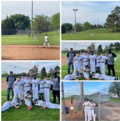
34 6 comments