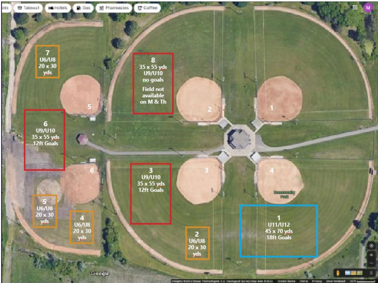
Huge thank you to the city of Fridley for making a field for the boys!!! The field looks awesome and the boys played great!! 6-4 winner for the home opener!! #fridleybaseball

Fridley Baseball Association has great numbers this year and the season started out well. They are using the Little League fields and Commons #2. The Parks Maintenance team adjusted the Commons #2 softball field so it can accommodate U12-13 baseball by creating a mound, extending the aglime and lengthening the base distances. Families are loving the new field!